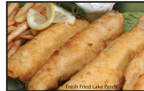
Fresh Fried Lake Perch

All dinners served with soup, salad or coleslaw, choice of Potato or Rice