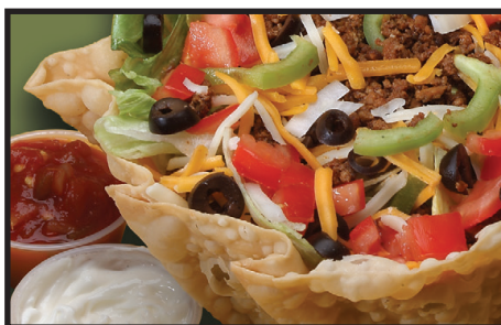
Chicken Quesadillas 10.99