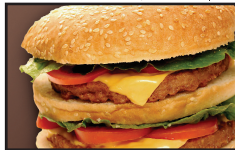
Double Decker 9.99

With French Fries, add 3.29 or Make it a Combo for Only 4.99 Your Choice of 2: French Fries, Coleslaw or Soup.